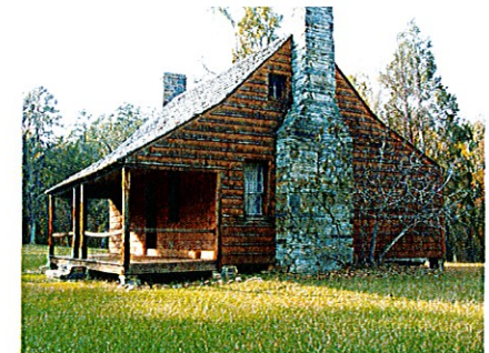
Dr. Francis J. Kron home Morrow Mountain State Park